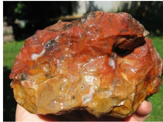
Jasper - Polk County, Ga. An Official Field Trip of the Cobb County Gem and Mineral Society, Inc. (Marietta, GA) (HOST) An Official Field Trip of the Mid-Ga Gem and Mineral Society

706-359-1544 (his business) or 706-401-3173 (his cell)