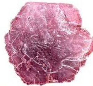
Lepidolite - Jequitinhonha valley, Southeast Brazil