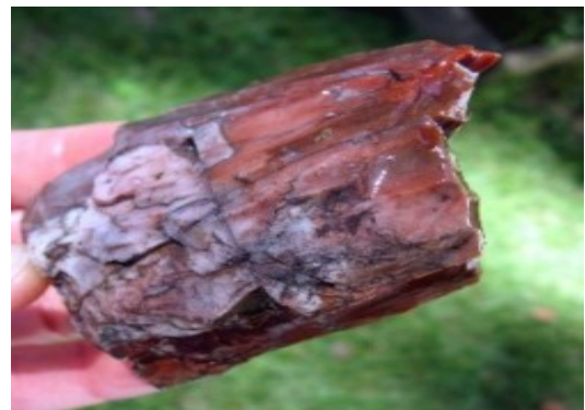
Jasper - Polk County, Ga.