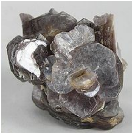
Lepidolite - Himalaya Mine- San Diego County

It can be polished but because of how soft it is, it makes a poor material for jewelry there than pins and pendants.